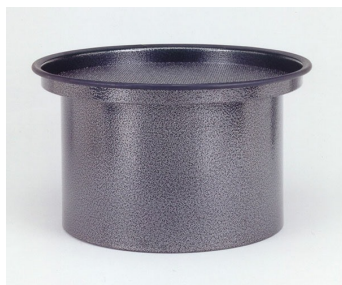
Activated Carbon Cartridge - Optional