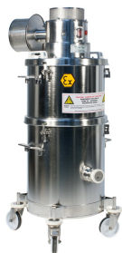
C-10 EX (4W) STAINLESS STEEL ULPA MRAC

Bitte beachten Sie, dass die Spezifikationen ohne vorherige Ankündigung geändert werden können