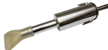
Needle Trap - Optional