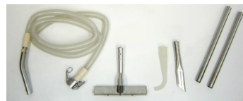
CWR EX Tools and Accessories - Included