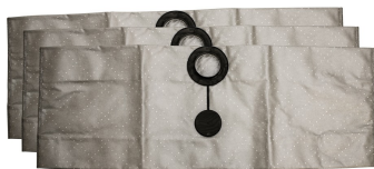
Conductive Recovery Bags - included